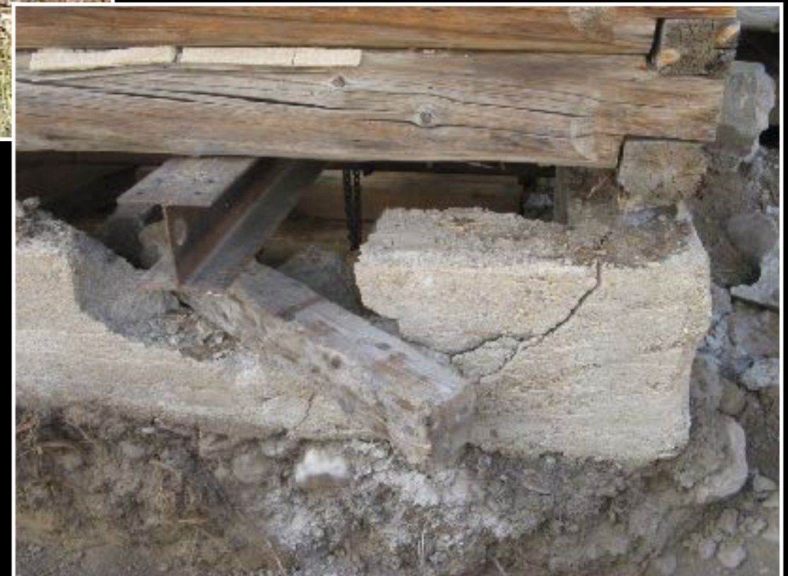
Main Cabin - Exterior, Roof & Foundation