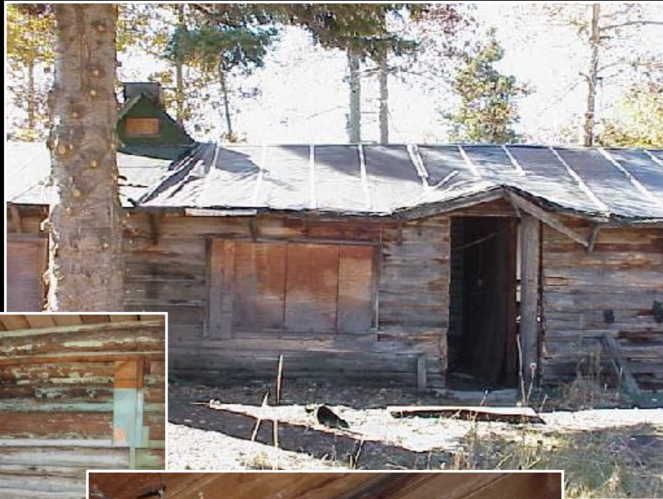
Main Cabin Kitchen