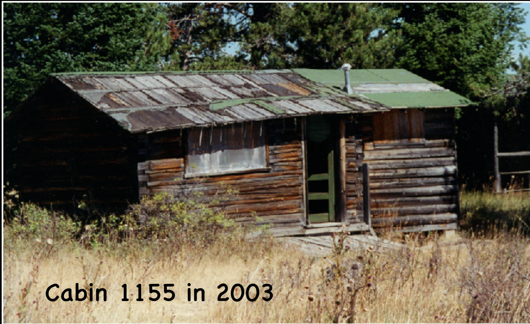
Cabin 1155 in 2003

Under Two Grand Teton National Park Superintendents, the Remaining Structures Deteriorated, 1985 - 2003