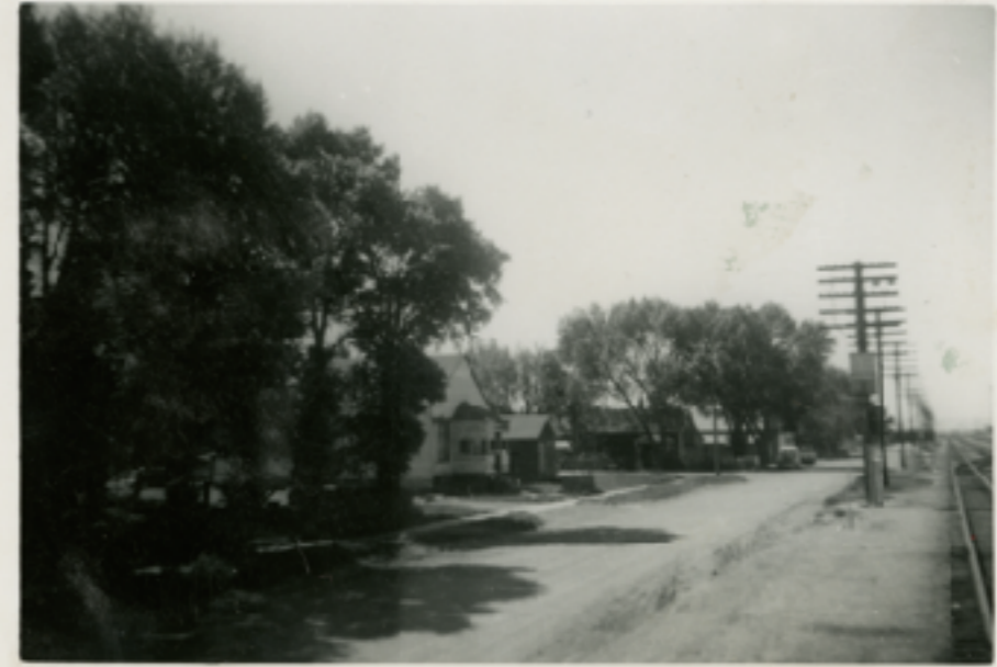
July 1955 - A TRAIN TRIP from Philadelphia - Chicago to Rock Springs, Wyo.