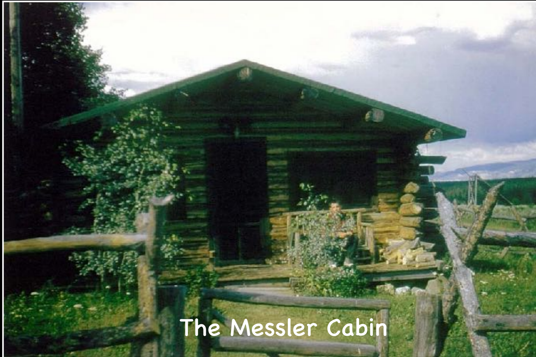
The Messler Cabin

Burned to the Ground, Perhaps by Hunters