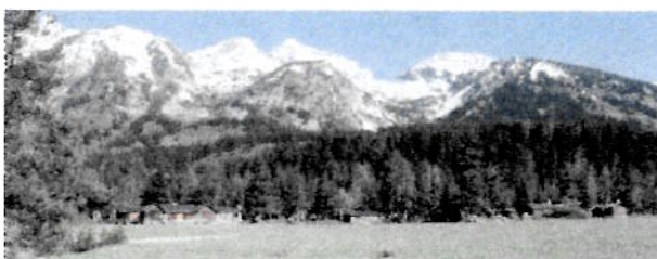
Added by: D C