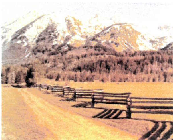
Added by: D C