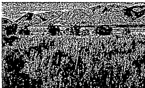
Cemetery