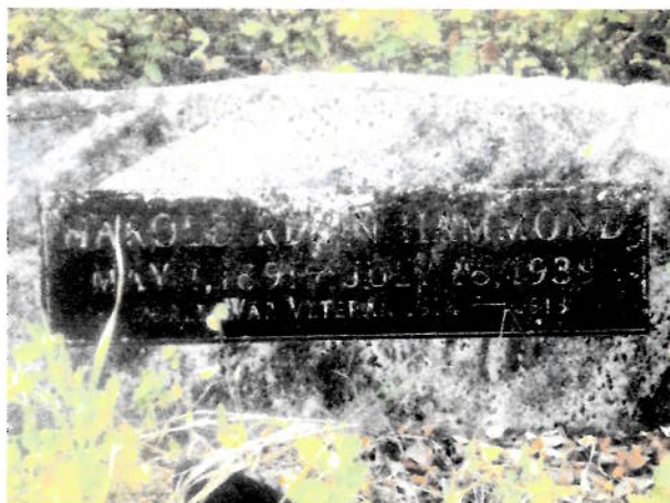
Added by: Cemetery Walker

Created by: D C Record added: Sep 30, 2013 Find A Grave Memorial# 117882502