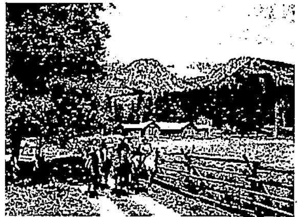
Horseback riding at the White Grass Dude Ranch, 1950s.