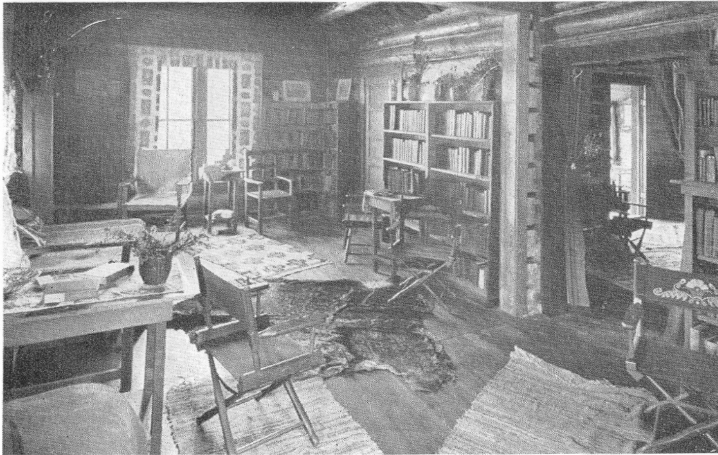
LIBRARY, WHITE GRASS RANCH

The White Grass Ranch is surrounded by the Grand Teton National Park. The ranch is secluded, being several miles from the main highway, and is one of the few beauty spots unspoiled by the encroachments of civilization. It is accessible to the chain of beautiful trails made by the Park Service. Swimming in the ranch's own swimming pool, fishing for large cut-throat, rainbow and mackinaw trout in the many nearby lakes and in the Snake River, within easy riding distance, horseback riding, hiking and mountain climbing are the main features of the ranch life.