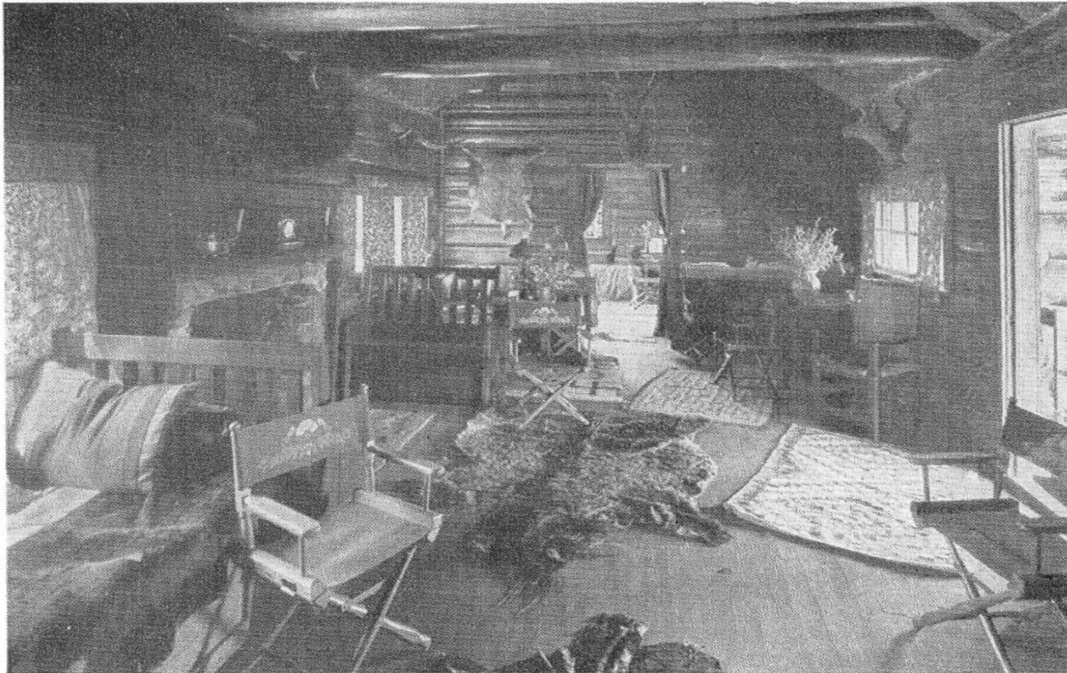
LIVING ROOM, WHITE GRASS RANCH

The White Grass Ranch is located in Jackson Hole, Wyoming, elevation of ranch is nearly 7,000 feet. The Valley of Jackson Hole, in the heart of the Rocky Mountains, has long been famous for its scenery, and for great herds of elk and other big game which makes it one of the most beautiful and best hunting countries in the United States. With pure air and strong sunshine it is an ideal place to rough it in comfort, in the open air. Western life in the saddle is the chief attraction of ranch life.