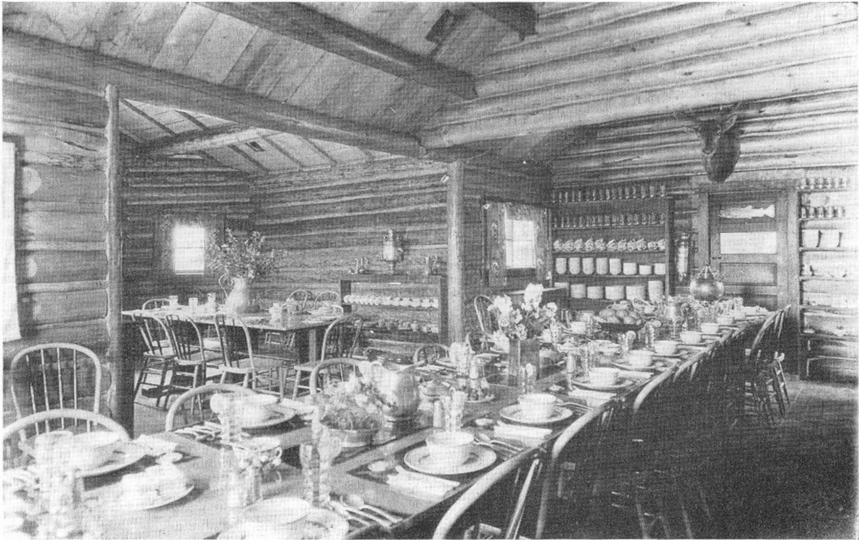
DINING ROOM, WHITE GRASS RANCH

To every guest is assigned a suitable horse for his exclusive use. The horses are wrangled each morning by the ranch cowboys, brought into the corrals and saddled for the day's ride. Even those who have never ridden before will soon find themselves at home in a western saddle. The White Grass has an excellent table, with plenty of fruits and fresh vegetables served daily, and milk from its own cows.